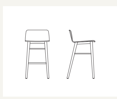
501-1302 Tami counter chair W430 x D505 x H865(SH665)