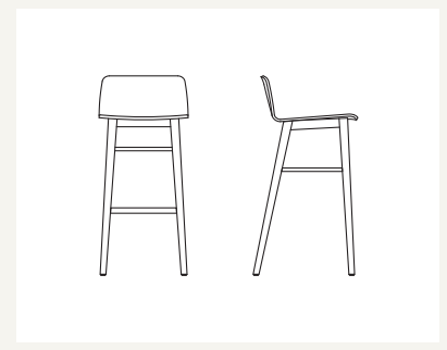
501-1301 Tami bar chair W430 x D505 x H965(SH765)