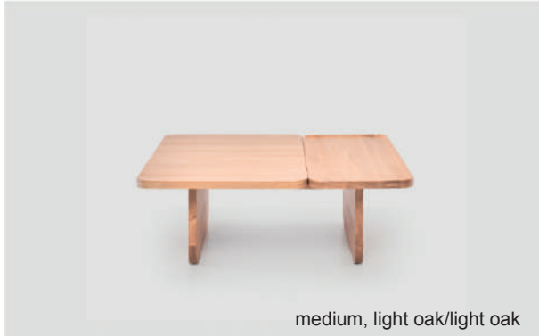
medium, light oak/light oak