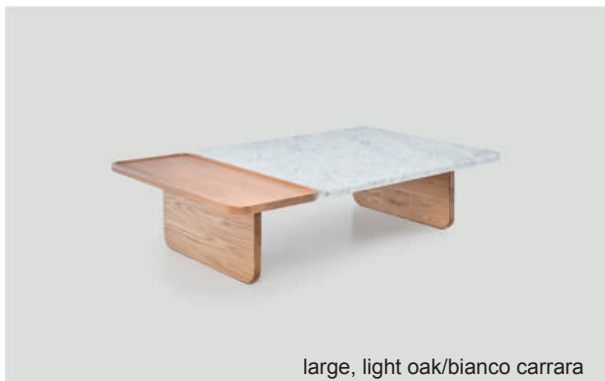
large, light oak/bianco carrara