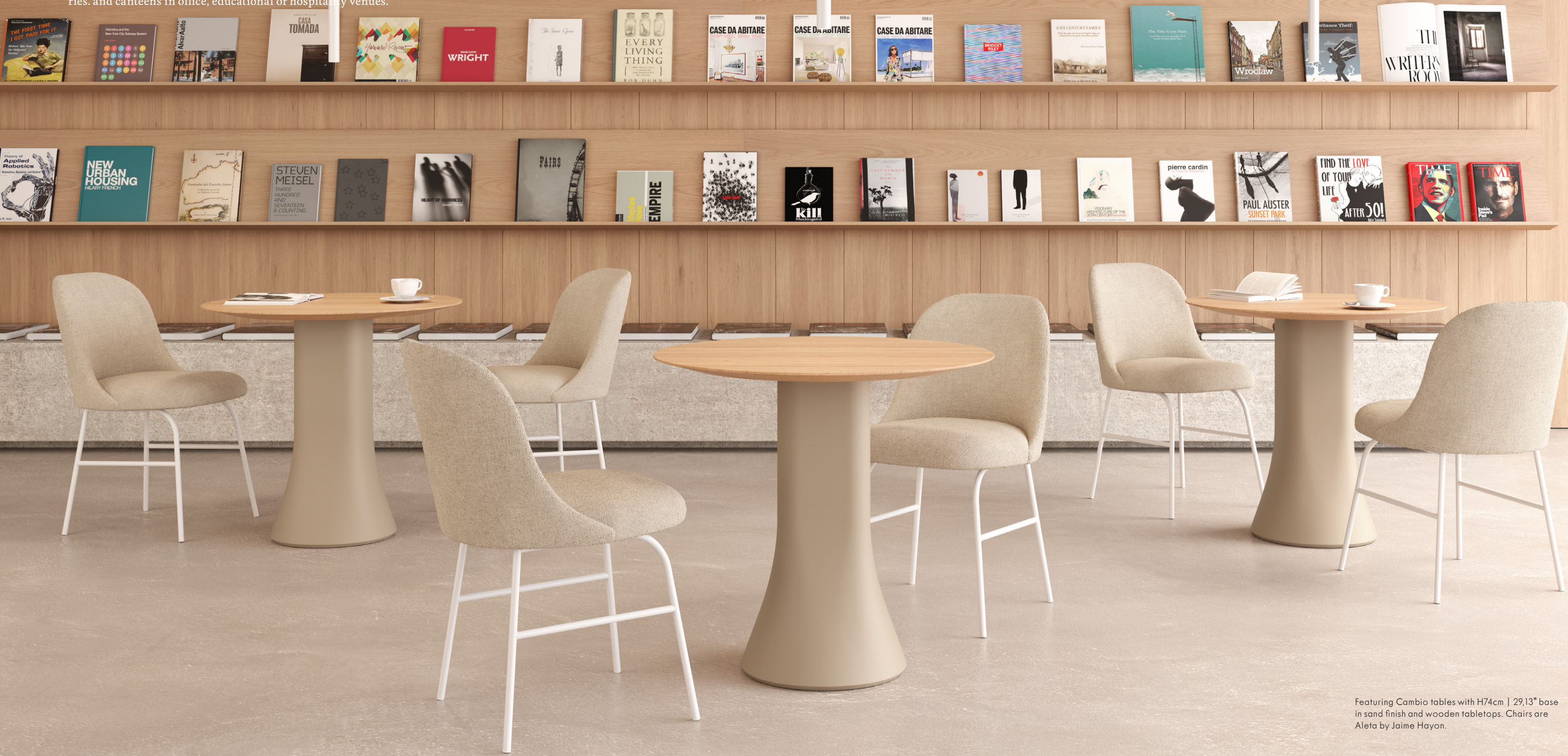
Featuring Cambio tables with H74cm | 29,13" base in sand finish and wooden tabletops. Chairs are Aleta by Jaime Hayon.

The different dimensions and multiple finishes for its tabletop effortlessly integrate Cambio in any working or dining scenario. Great as a bistro table for modern cafés or restaurants, the collection is also a great fit for collaborative or co-working spaces, libraries, and canteens in office, educational or hospitality venues.