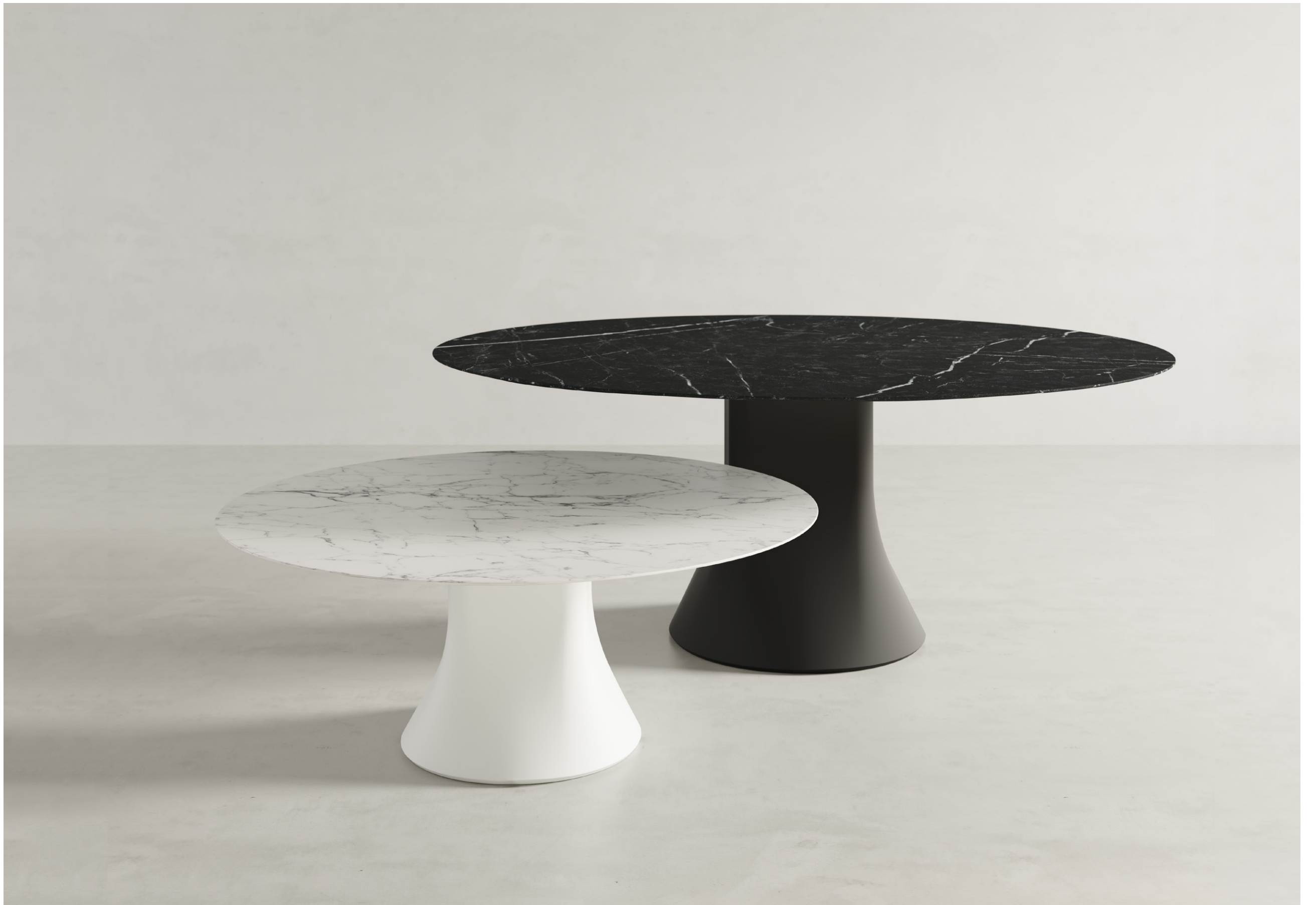
On these pages, featuring Cambio table H74cm | 29,13" Ø150cm | 59,05" tabletop in black marble and Cambio table H45cm | 17,71" Ø120cm | Ø47,24" tabletop in white marble.