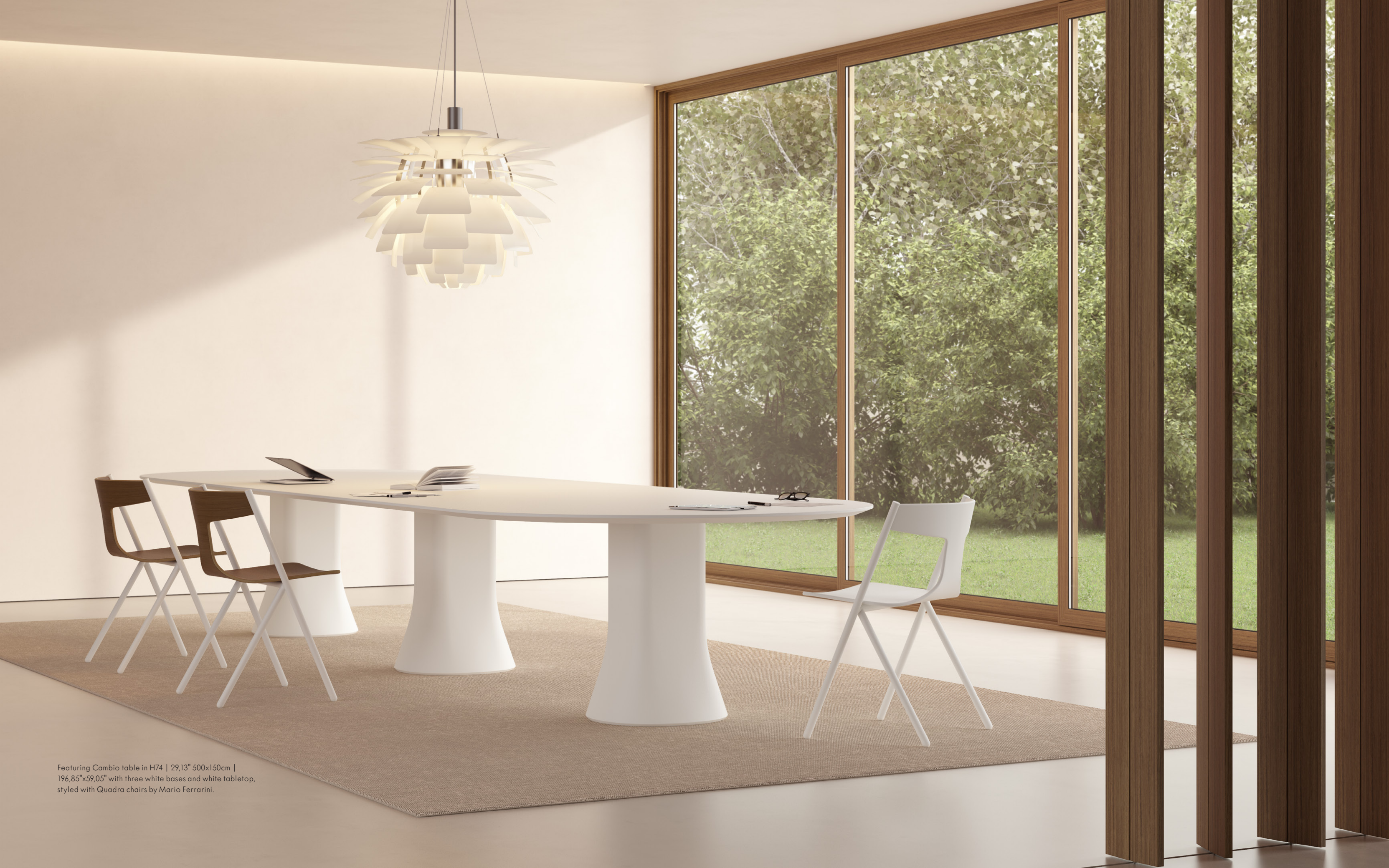
Featuring Cambio table in H74 | 29,13" 500x150cm | 196,85"x59,05" with three white bases and white tabletop, styled with Quadra chairs by Mario Ferrarini.