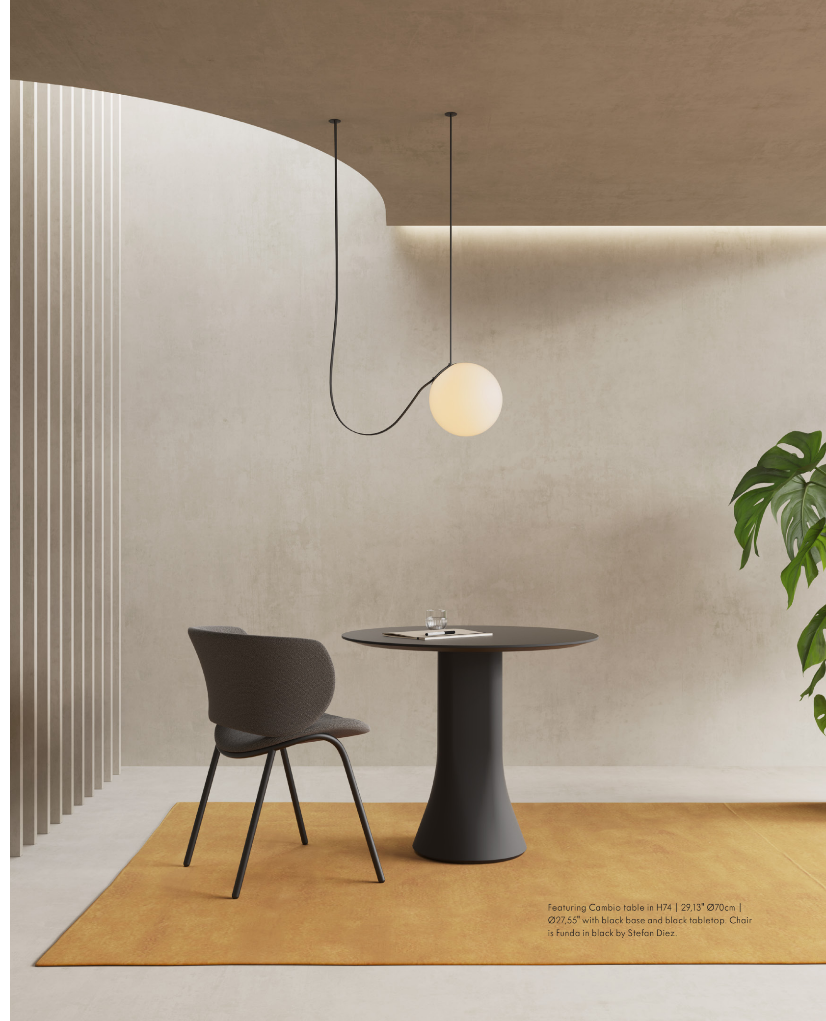
Featuring Cambio table in H74 | 29,13" Ø70cm | Ø27,55" with black base and black tabletop. Chair is Funda in black by Stefan Diez.