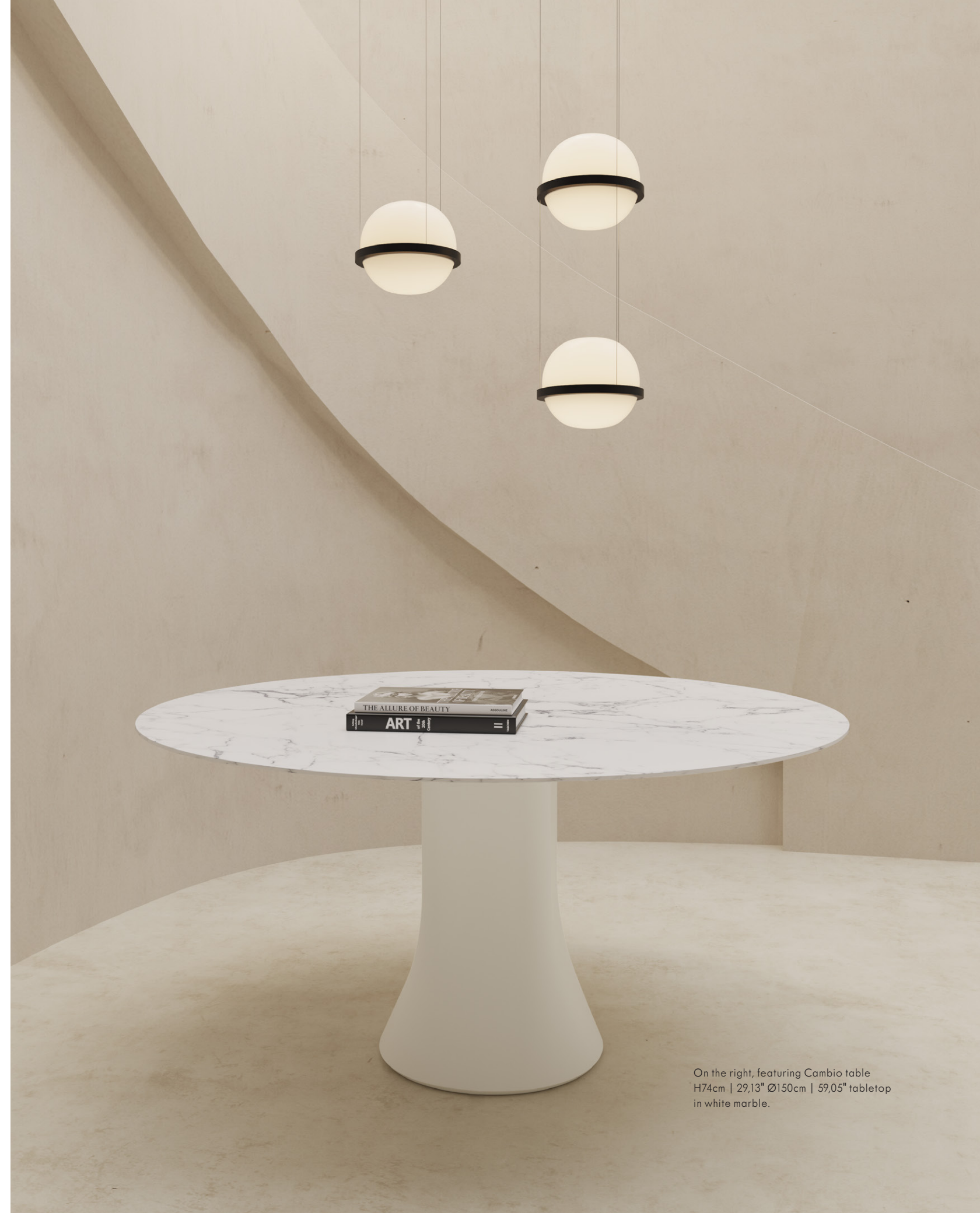
On the right, featuring Cambio table H74cm | 29,13" Ø150cm | 59,05" tabletop in white marble.

This year we have incorporated marble as our latest addition to craft the tabletops in our collection. Marble is a fine stone, one of the most environmentally friendly materials and enduring surfaces to work or dine. Due to its classic expression, it complements any chair, armchair and sofa in our collection, upgrading the overall design experience.