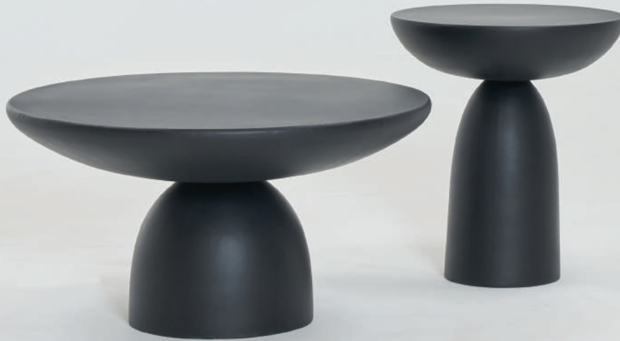
Ramel coffee : black + walnut