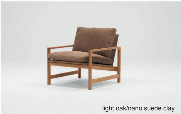
light oak/nano suede clay