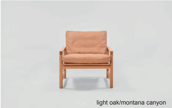
light oak/montana canyon