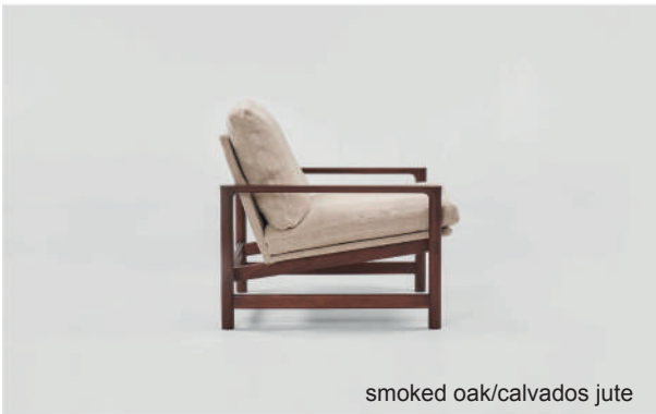
smoked oak/calvados jute